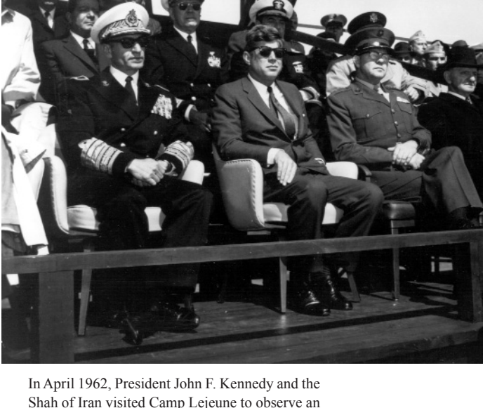
Shah of Iran visited Camp Lejeune to observe an amphibious landing exercise.

As Cold War tensions intensified, and as weapons and tactics grew more technologically advanced, the Marine Corps developed techniques and equipment that would keep pace with these advancements. New assault techniques